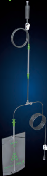
Transfer line for soft bag filling with CM* in ScanBag®