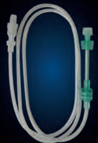
Single use safety patient line with double-level valve - 100cm