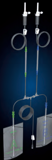
Transfer line for CM* in vial and NaCl in vial