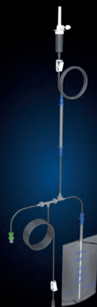
Transfer line for CM* in ScanBag® and NaCl in vial