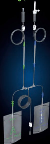
Transfer line for soft bag filling with CM* in ScanBag® and NaCl in vial