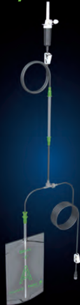
Transfer line for CM* in vial